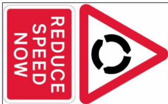
SIGNAGE EXAMPLE Diagram 510 with 511 plate